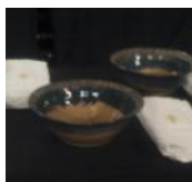
Sunday morning, the E.S. District Bd. of Laity presented each District Office with a servant pottery bowl and towel.

The Agape Children's Ctr. was 1 of 4 recipients of AC Offering!