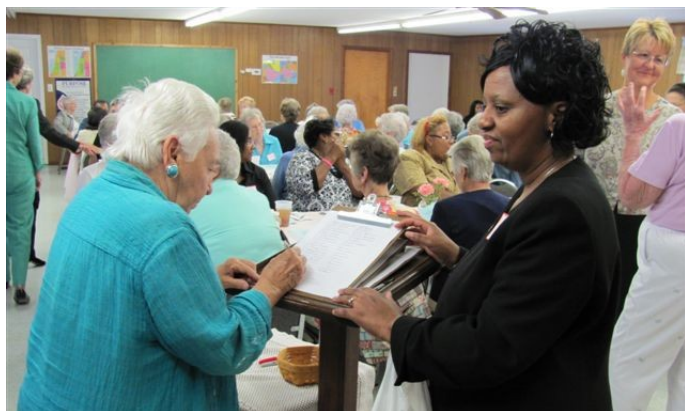
Photo: 2010 Annual Meeting